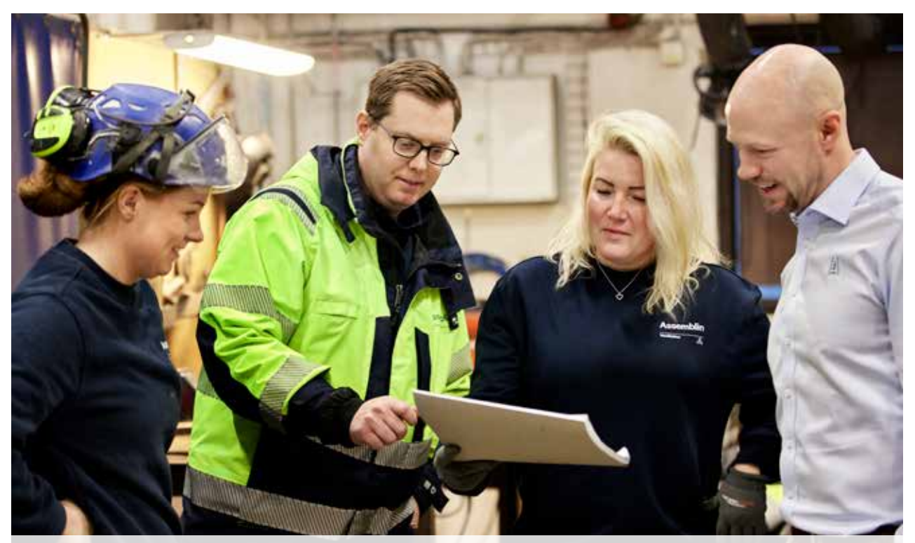
Although Assemblin is a strong, decentralised organisation, to ensure a shared standard a Group-wide framework is in place that, among other things, it is based on an internal body of regulations and on shared values. This framework is available on Assemblin's Intranet and instituted through courses.