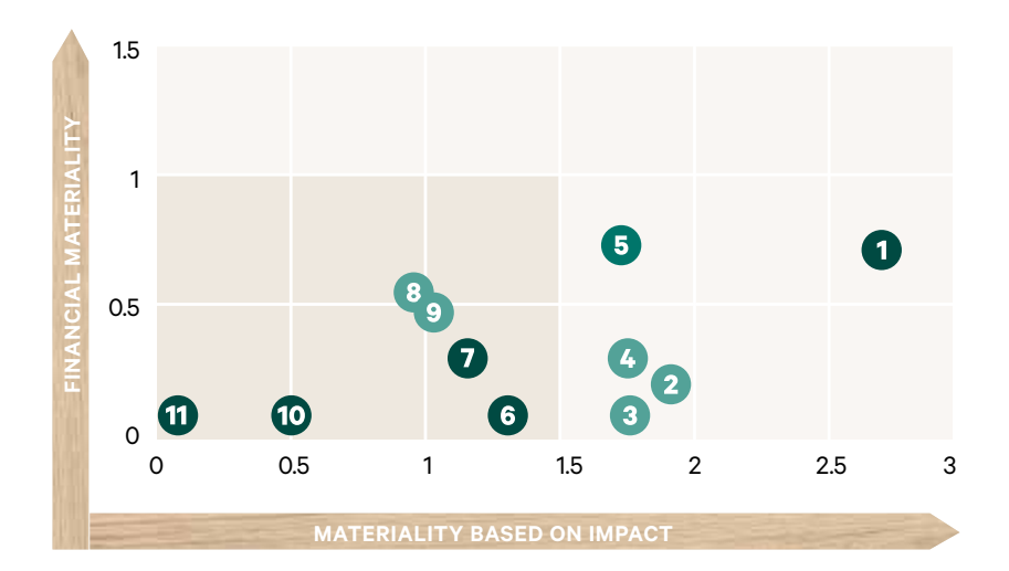
In late 2023, Assemblin conducted a double materiality analysis in accordance with the methodology in the ESRS. Accordingly, the operations were analysed from an impact perspective and from a financial perspective, based on established sustainability topics, sub-topics and partial sub-topics. Among all of these areas, some have been perceived as more relevant to Assemblin than the others, and are reported above. There, it can also be seen which of the relevant areas are most material for us. For more information about the materiality analysis, see Sustainability Note S2. For more information about our material sustainability aspects, see pages 50–60.