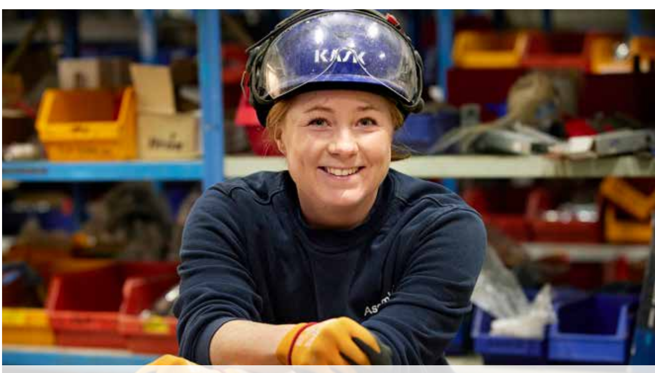
Although customer requirements vary, since 2019, Assemblin applies a Group-wide minimum standard for personal protective equipment for work at building sites.