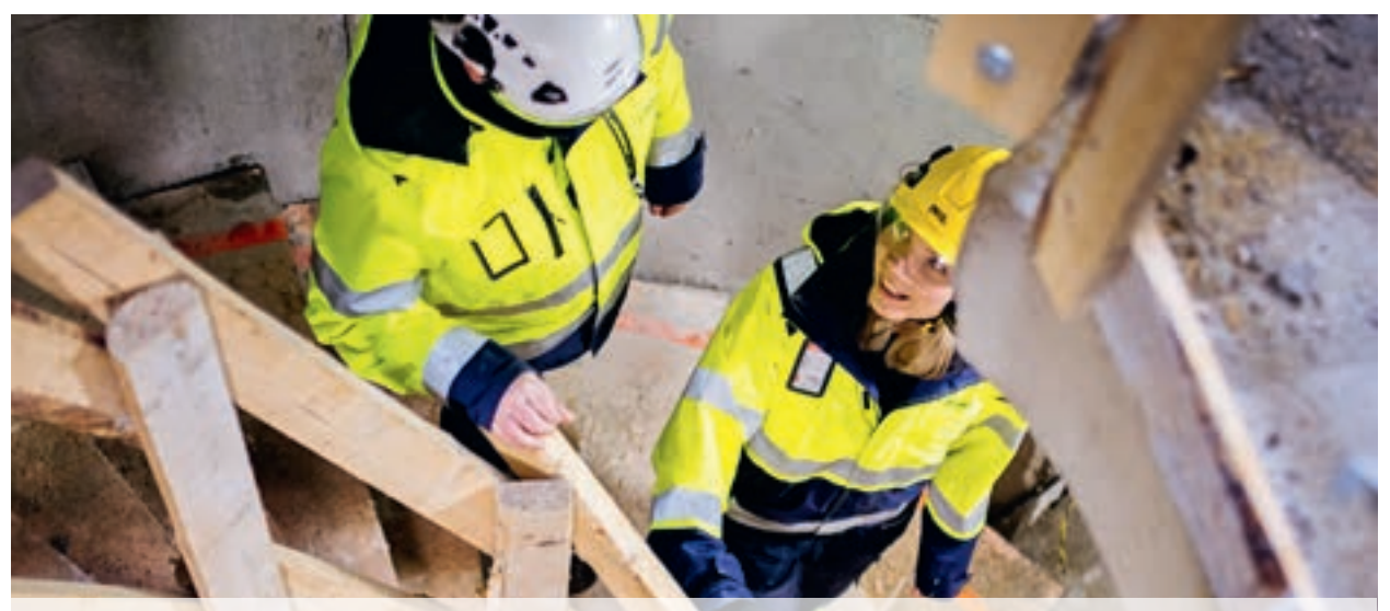
A challenge for Assemblin is that our clients apply different safety requirements. We have therefore introduced our own minimum standard for personal protective equipment at construction sites, which applies regardless of our clients' requirements.